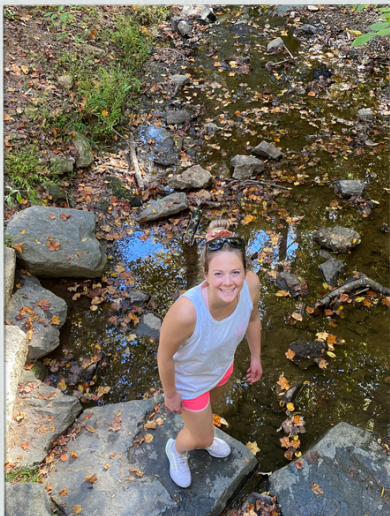
Volunteering with the library and RMHC!