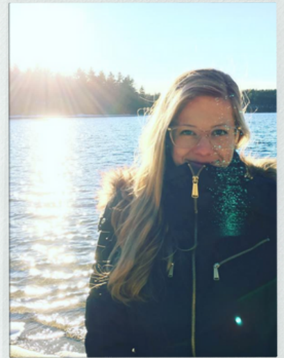
Email, call, or text me!