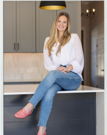
Listen and support my clients...I am here for you!

What is your favorite thing to do as a Realtor?